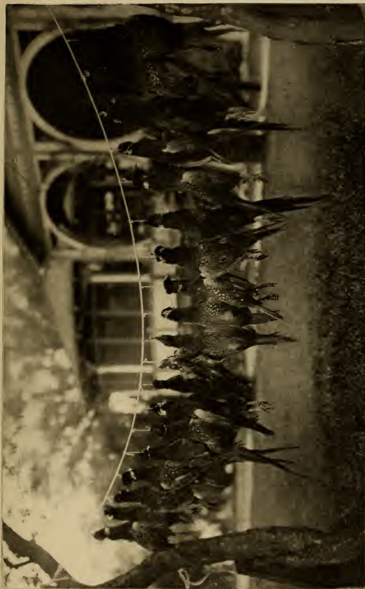
"PHEASANTS" KILLED ON J E K Y L